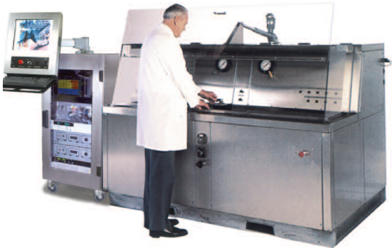
AAI offers a range of aviation test systems, as well as support and spares.

AAI's Utah Technology Center is your exclusive center for all support, upgrades and spare parts for previously delivered AAI test equipment from ACL Technologies. As an experienced systems provider, we also offer new, highly versatile test equipment for multiple applications through strategic technology partnerships.