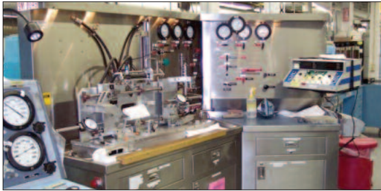
AAI renovates and upgrades a variety of military test technologies.

AAI modernizes aging military systems through upgrades, modifications and technology insertion — improving performance, increasing reliability and lowering life cycle costs. Our engineers and technicians provide support services across multiple technical disciplines including electronic, electro-mechanical, hydraulic, pneumatic, electro-optic and software technologies.